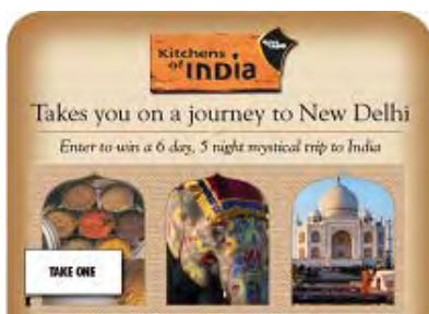
Header for Shippers!