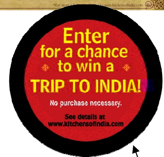
On every pack!

a division of World Finer Foods, Inc. 300 Broadacres Drive, Bloomfield, NJ 07003 Ph 973.338.0300 Fax 973.338.0382